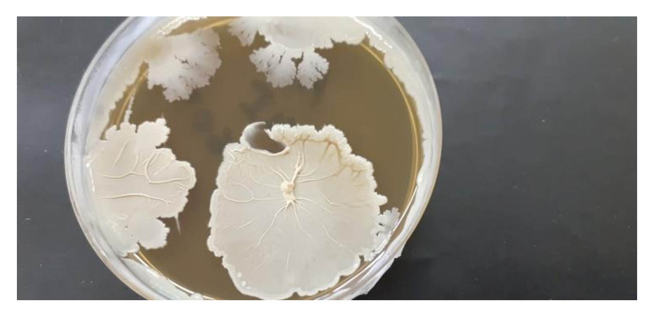
Fig. 6 A culture of new bacterial strain of Bacillus subtilis MSP4