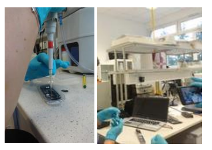
Fig. 3 Work in a wet laboratory - preparation of a sample for sequencing