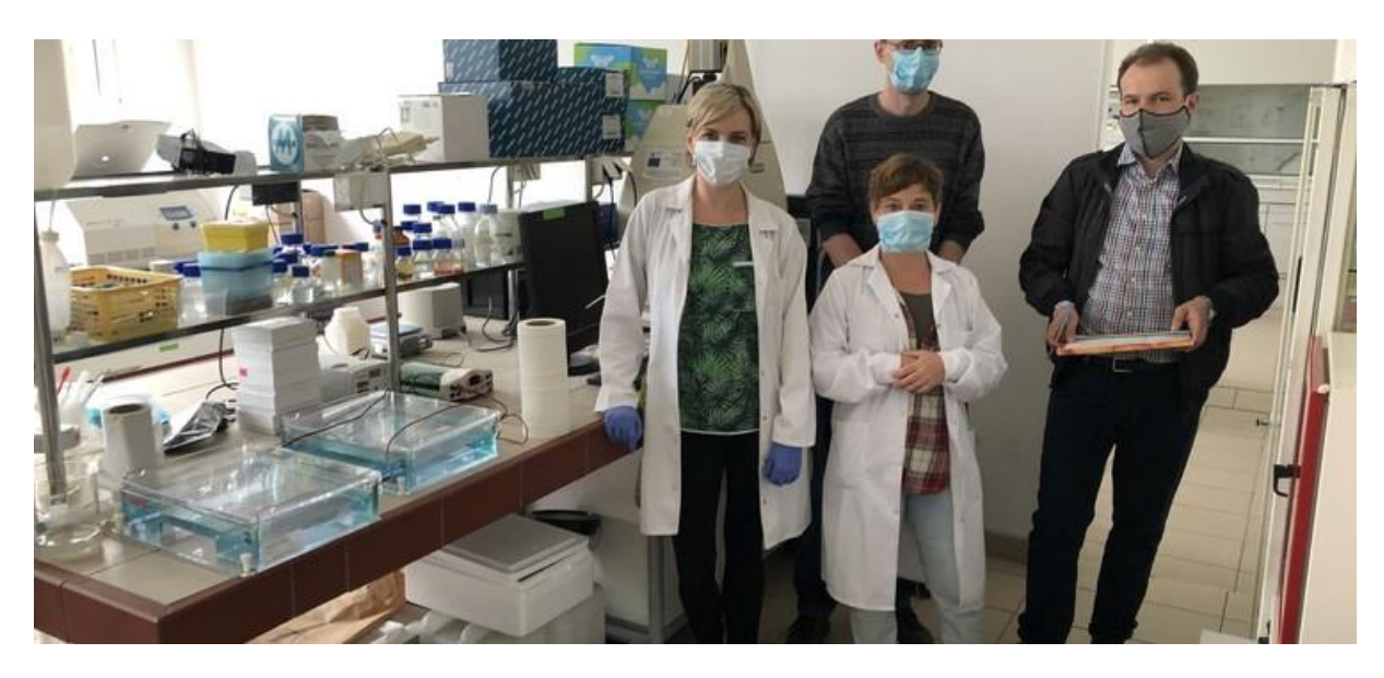
Fig. 2 Preparation of the first sequencing experiment.

Fig. 1 Seminar entitled Bioinformatic analyzes of bacterial genomes for commercial applications