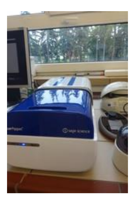
Fig. 5 The Blue Pippin device

Fig. 4 MinION devices purchased in the project