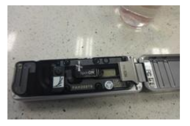
Fig. 4 MinION devices purchased in the project

Fig. 3 Work in a wet laboratory - preparation of a sample for sequencing