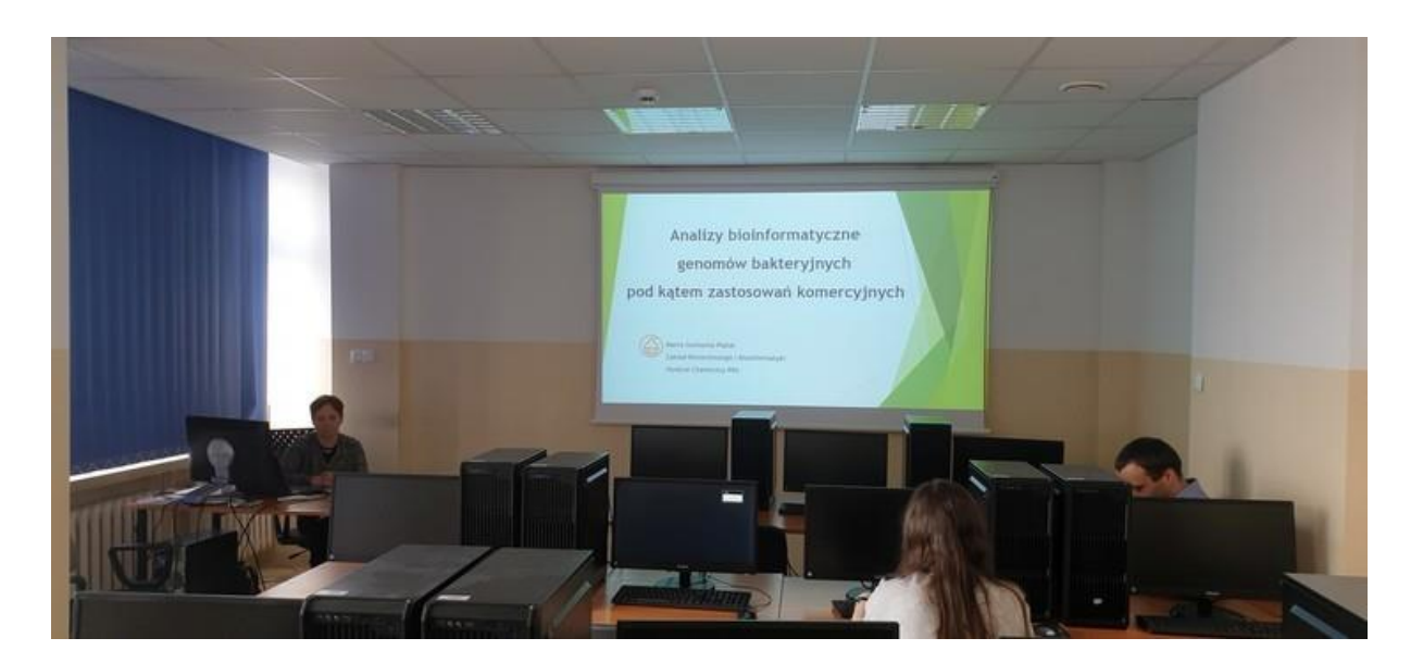
Fig. 1 Seminar entitled Bioinformatic analyzes of bacterial genomes for commercial applications